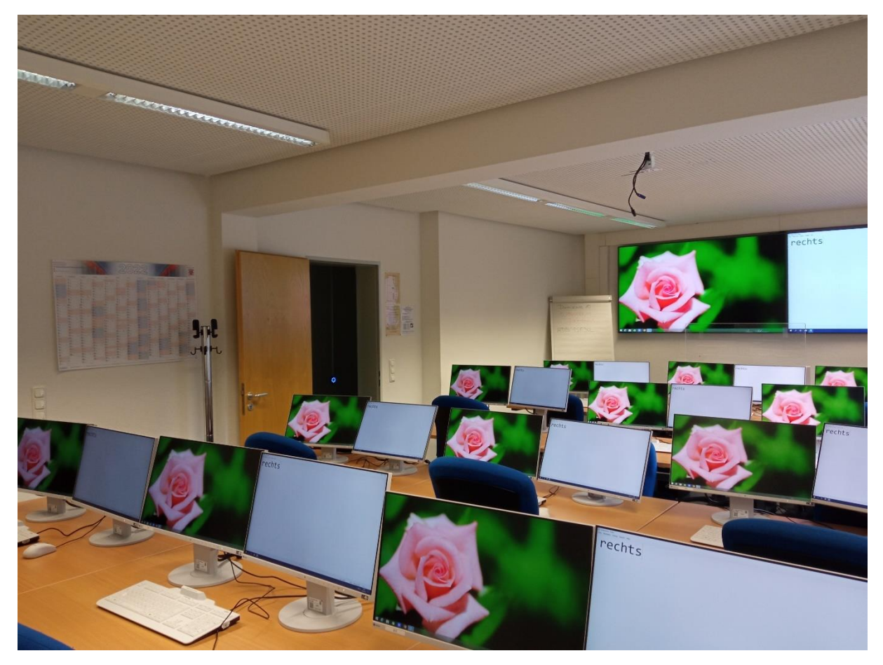
Photo from a training room at the IT department (4 rows of 3 workstations each, each with two screens per seat)

The alphadidact® digital multimedia system includes 1+12 to 16 double-screen workstations, document cameras, laptops and two 85" displays.