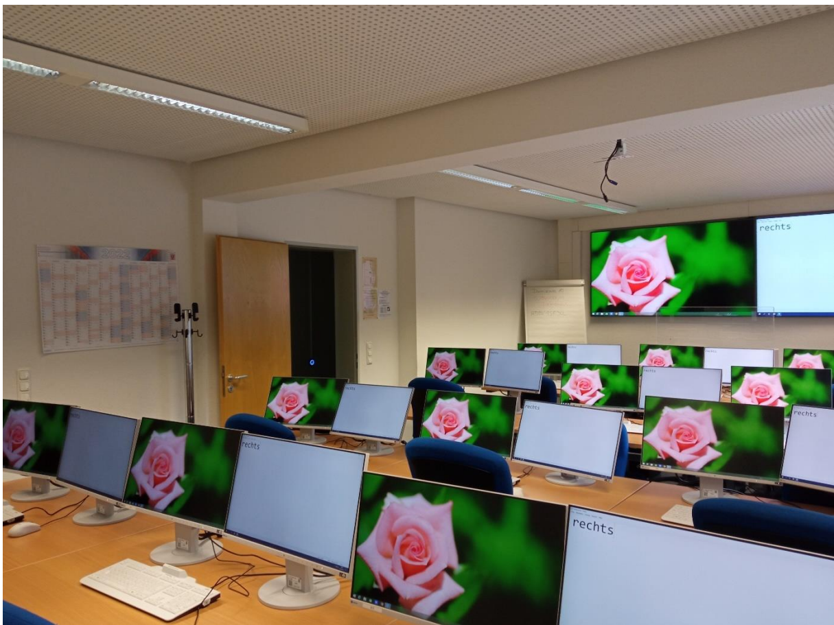
Photo from a training room at the IT department (4 rows of 3 workstations each, each with two screens per seat)

The alphadidact® digital multimedia system includes 1+12 to 16 double-screen workstations, document cameras, laptops and two 85" displays.